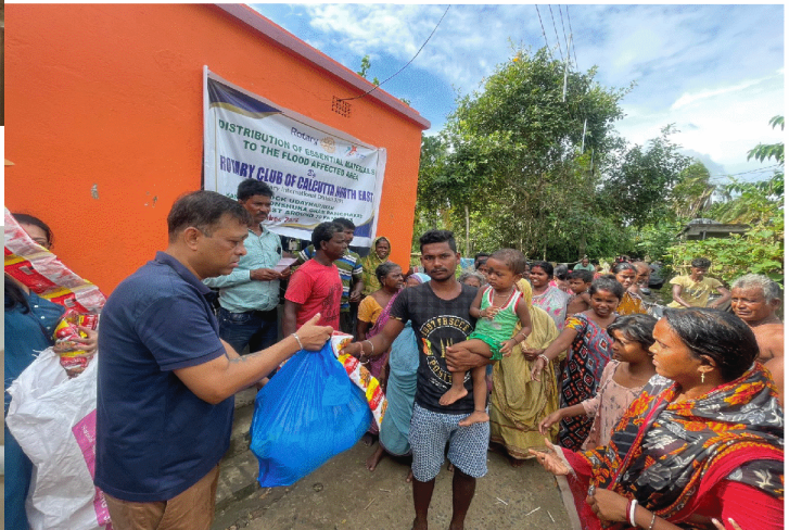
Distribution of Releif materials at Udaynarayanpur