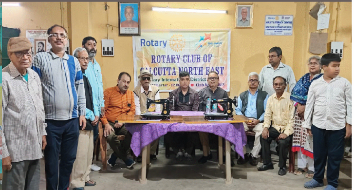
Adult Literacy Project on 2nd February at Mashisbathan Krishnapur Unnayan Samity