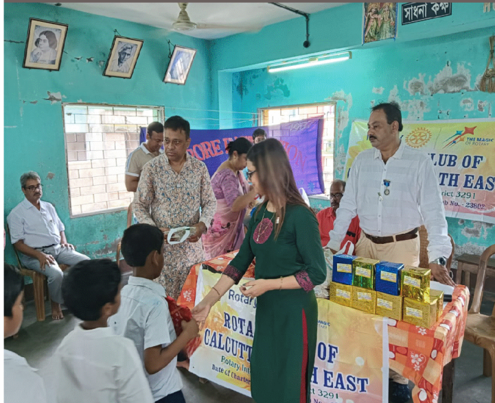
RC Calcutta North East celebrated Children’s Day with students of Kashipur Boys School