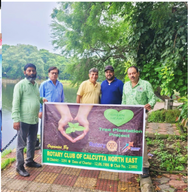
GREEN HEART - A TREE PLANTATION INITIATIVE OF RC CALCUTTA NORTH EAST